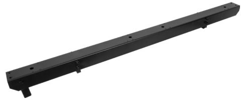
AP6TH2B1 / AP6TH2B2