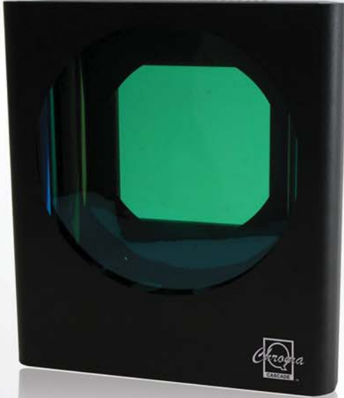
Cascade colour mixing process

- Mix over 300 colours from a single unit