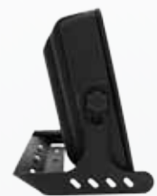
CF Compact side profile