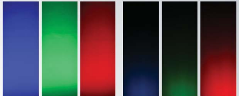
Color Force Output

Opposite demonstrates the Color Force output compared to a traditional 1kW cyc flood. Identical camera settings were used in the comparative photos.