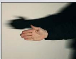
Single colour output RGBA optics mix within the fixture, practically eliminating multicoloured shadows and providing natural flesh tones.